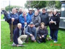
St. Joseph, Lincoln

San Francisco, CA (LifeNews.com) -- More than 35,000 pro-life advocates joined the West Coast Walk for Life on Saturday and they appeared in a jubilant mood given the indefinite stalling of the pro-abortion health care bill in Congress. People from across the state and Pacific Coast walked from Justin Herman Plaza to the Marina district.