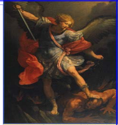
Archangel St. Michael by Guido Reni